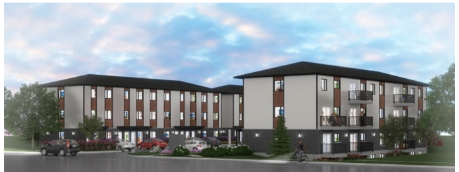
Rendering of Garafraxa Village

Construction is progressing well at our Garafraxa Village development in Fergus, a 32-unit stacked townhome community offering 2-, 3-, and 4-bedroom layouts, including accessible options. We've conditionally approved 10 families and anticipate move-in by Fall 2025.