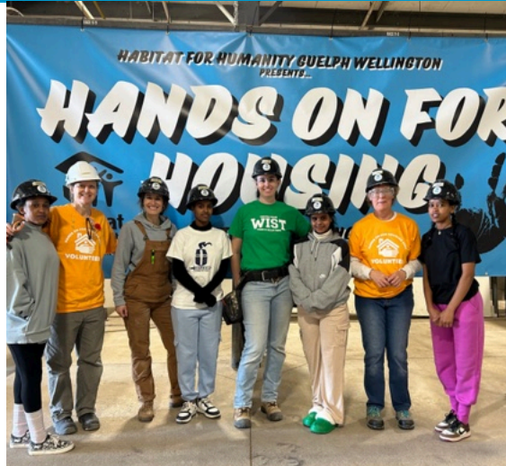
Top: Instructors from Conestoga College WIST program guiding Starling Services students in building an 8'x8' shed in just 3 days!

From November 6th to 8th, Habitat for Humanity Guelph Wellington and the Grand River Raceway in Elora hosted an extraordinary event—the Hands On For Housing Youth Conference. This event brought together nearly 150 students and youth from across Wellington County, fostering leadership, hands-on skill-building, and community engagement in addressing the region’s housing challenges.